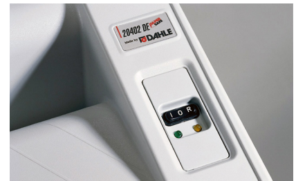
The shredder's toggle switch allows for Automatic on/off, continuous run, and reverse operation.