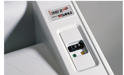
The shredder's toggle switch allows for Automatic on/off, continuous run, and reverse operation.