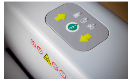
Touch pad with LED indicators ensure you have total control of all shredder functions.